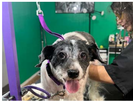
Getting a fresh new look!