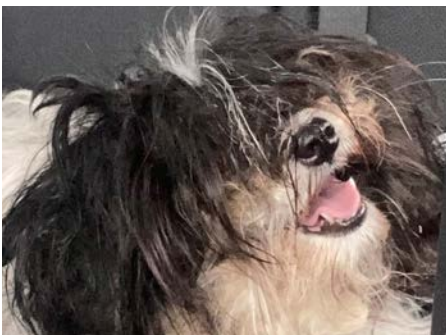
Angel's hair was so long she could barely see.